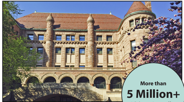
American Museum of Natural History